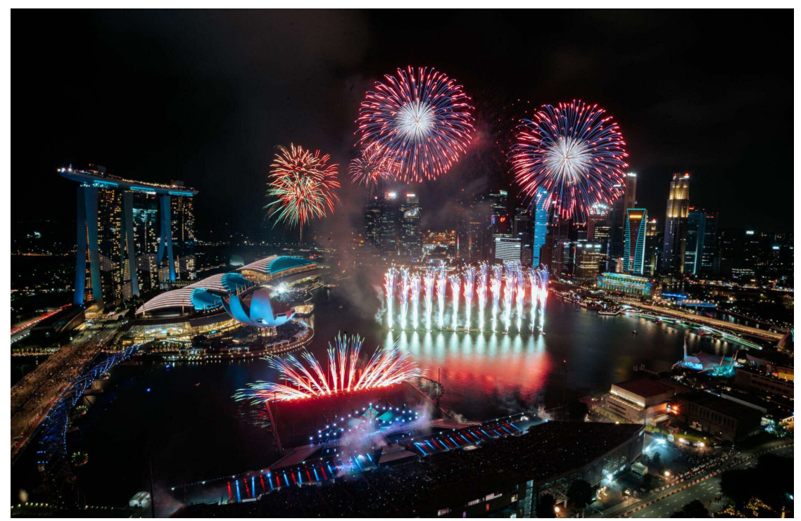
Fireworks illuminated the skyline with exuberant colours to ring in 2023 at the Marina Bay Singapore Countdown last year.

16 November 2023 – Come December, prepare to be dazzled and thrilled as we usher in the new year at Singapore's largest countdown celebration, the Marina Bay Singapore Countdown 2024 . Presented by the Urban Redevelopment Authority (URA), this year's countdown promises an unforgettable experience for revellers of all ages and backgrounds, with a breathtaking fireworks show, inspiring light projections, exhilarating attractions such as a go-kart arena and winter playground as well as exciting live performances.