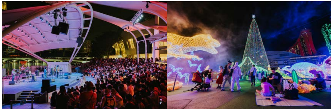
From Left - Right: Esplanade's Come Together, illumi

In the hour leading up to the new year, the fireworks unfolded in four chapters and illuminated the iconic Marina Bay skyline with vibrant bursts of colours across the night sky. MBSC 2025 punctuated the ringing in of the New Year at midnight with the debut of specially curated orchid motifs, designed by the team behind STAR ISLAND.